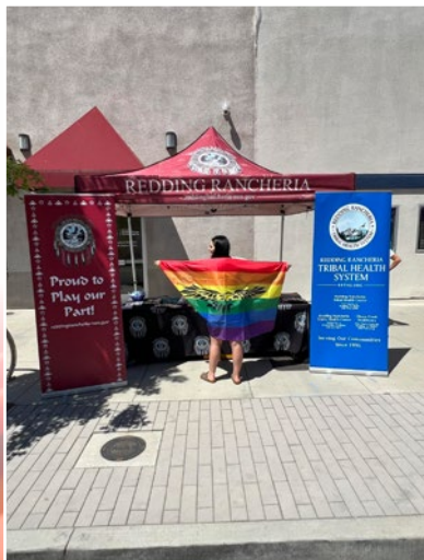
Redding Rancheria's Pride booth.

Loves always wins and the rainbow will shine! The Redding Pride festival was a huge party and it was an amazing day to gather in the pursuit of equal justice for the LGBTQIA+ Community. We as humans all seek love and support! We all want to be seen, heard, and allowed to express ourselves as we see fit! The Redding Rancheria encourages and supports all peoples to be proud of who they are and whom they love. Here is to celebrating throughout the year in recognition of love and its power to overcome and conquer the darkness.