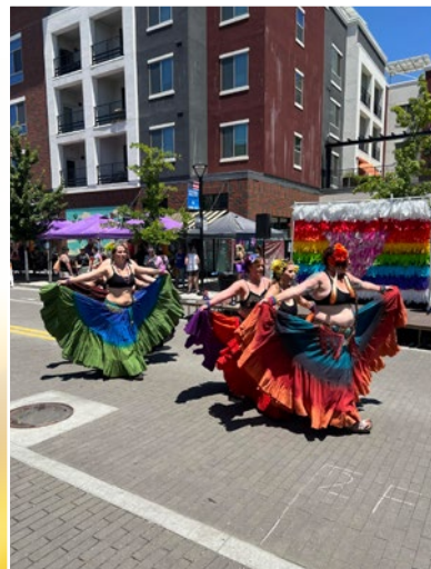
Dancers at Pride!