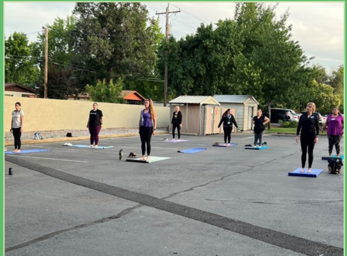
Employees enjoying outdoor yoga.