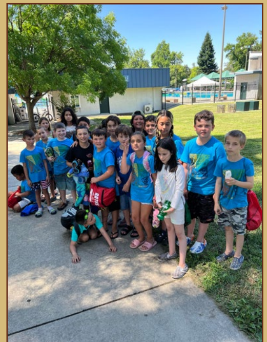
Our awesome campers.