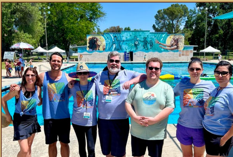
Our dedicated staff.

A highlight of the camp is the variety of exciting activities and the engaging guest speakers who bring expertise and enthusiasm to each topic. These speakers include mental health professionals, Dietitians, fitness trainers, hygienists, and community Elders, all of whom make learning fun with interactive sessions that captivate the kids’ attention. From high-energy fitness challenges to mindfulness games and stories told by Elders, each day is packed with activities that both educate and entertain. This combination of structured learning and playful activities ensures that the children not only gain valuable health knowledge but also have an unforgettable and enjoyable experience.