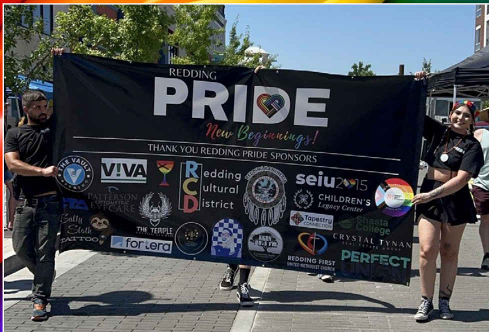
The Pride Parade