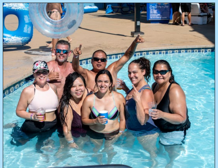
Team members and their families having a blast.