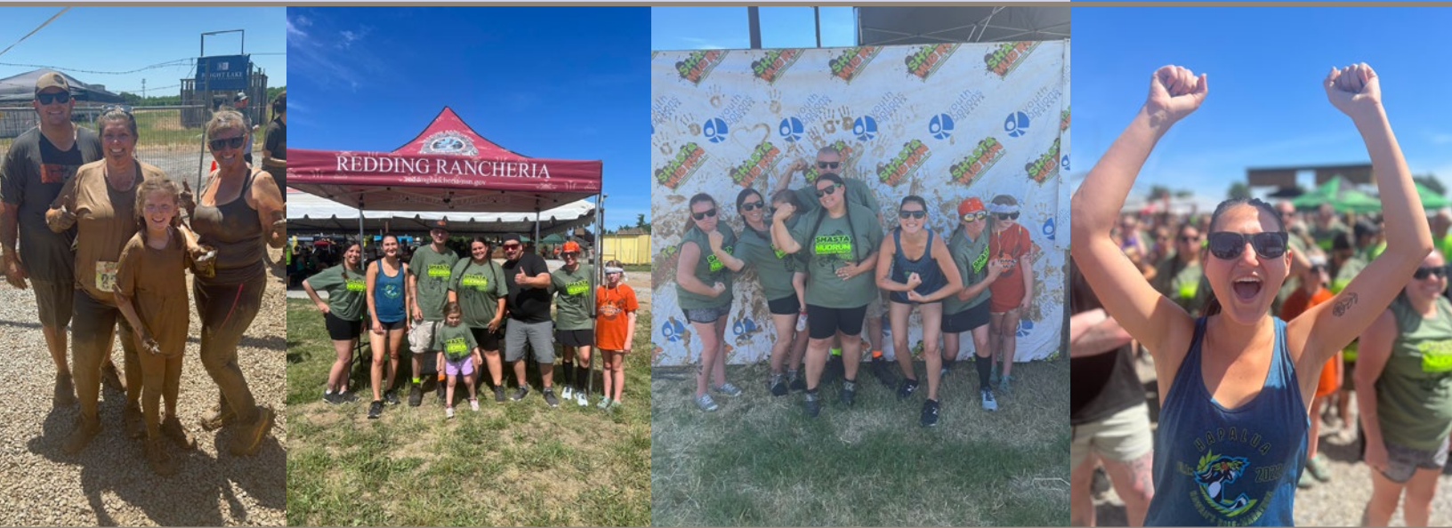
Our staff getting muddy!

Thank you to Youth Options for offering such valuable services to the youth in our community! We are proud to be part of this event and cannot wait for next year's Mud Run!